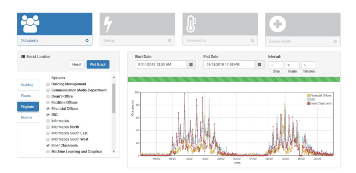
Figure 1: Screenshot of the Building Analytics app.

The focus of the demo is on the Building Analytics App, shown in Figure 1. This app provides analytics about data gathered from multiple sensors in the building (e.g., occupancy, temperature, and energy consumption). The user can view occupancy data for different time intervals and space granularities. The application is designed to gain an understanding of how the building is used as a function of time in order to better plan spaces and events, as well as to better control HVAC systems in order to be more energy efficient. For instance, patterns of building usage by occupants for different regions of the building could lead to customized HVAC settings that save energy without inconveniencing occupants. Likewise, occupancy data can also be used to determine if there are regions in the building that are under/over utilized and such information can lead to plans for better space management (e.g., understanding class rooms that are overflowing or underflowing or determining which lounge spaces are popular). The tasks we choose for our experimental game described as part of this demo are motivated by such real world needs of building analysts. For the context of this demo, the main focus is on occupancy data which is derived from PRESENCE data stream. The PRESENCE data stream has continuously been collected now for about two years, resulting in about 300 million location events since January 2016.