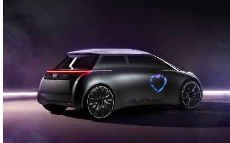
Figure 1. Emotion awareness: crucial for vehicle interaction with passengers and road users.