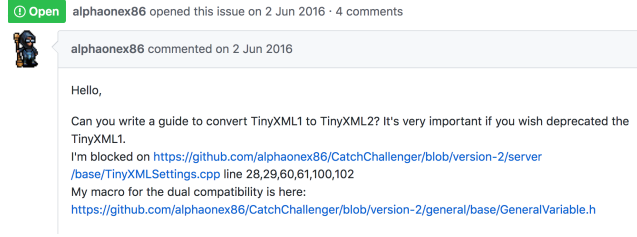
Figure 1: GitHub issue for TinyXML

to establish that the functional and non-functional requirements of the resulting system are maintained.