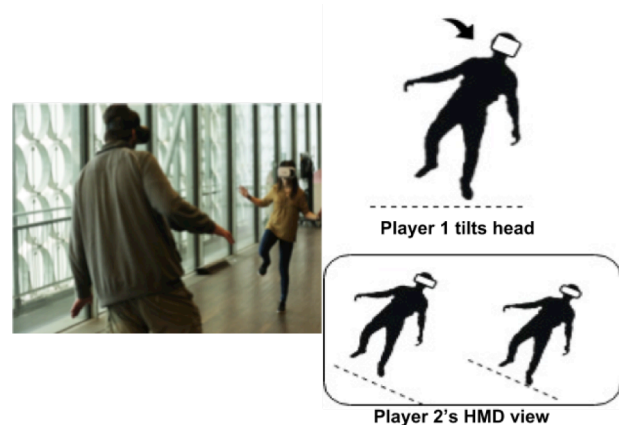
Figure 1: Left - AR Fighter. Right – as player 1 tilts head, player 2’s HMD exaggerates how much player 1 is leaning.

begun to explore ways of affecting the “stability of perception” in digital games. For example, we have previously shown that games can use galvanic vestibular stimulation (GVS) – an electronic system that affects the inner ear and hence one’s vestibular sense – in order to confuse players’ sense of balance, and thus destroy the stability of their perception, in order to create engaging gameplay experiences [6,7]. We extend this prior work by proposing that we do not need to send electronic currents through people’s heads, but could rather use HMDs, in particular their ability to cause disorientation, as a way to affect the stability of perception in order to create engaging digital vertigo experiences.