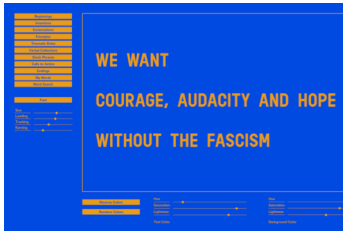
Figure 5: Manifesto Machine drop-down lists, canvas, and controls.