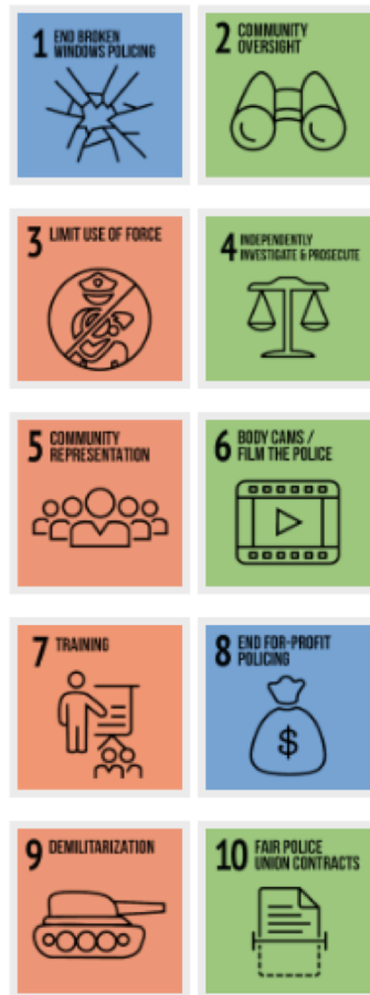
Figure 2: Clickable categories for the We The Protesters (WTP) 10-point Campaign Zero manifesto, commonly associated with #BlackLivesMatter (2015).

repurposing of the manifesto as a "call to attention" and narrative vision for confronting new prospects and making manifest the search for universality [6]. Latour's compositionist framing stands in contrast with the "violence and precision" [8] that characterize avant-garde manifestos of the previous century. Instead of bold rhetoric hastening us into the world of the beyond, "so unrealistic, so utopian, so full of hype" [6], Latour urges a slower, more careful stitching together of truths in search of the Common .