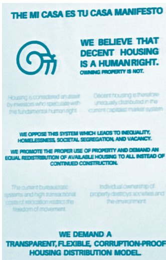
Figure 6: Manifesto generated at the Collaborative Economy Training School writing workshop, Funchal, Portugal.

2017; more recently, we hosted a workshop in April 2018 involving university Design students. Both interventions resulted in insights - such as connecting users to their emotions, making visual impact, and the potential of the Manifesto Machine as an educational tool - that have informed or reinforced the design.