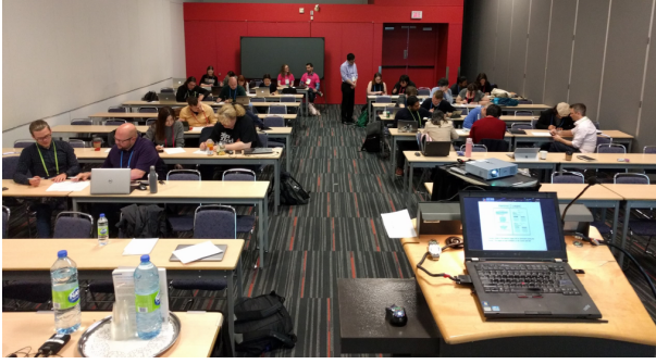
Figure 3: In-class experiment for this course at a previous CHI conference.