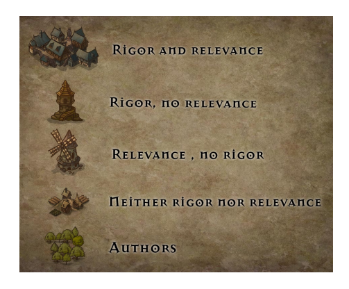
Fig. 2. Legend of the visual RET map.

evaluated through a case study and is used internally at the company.