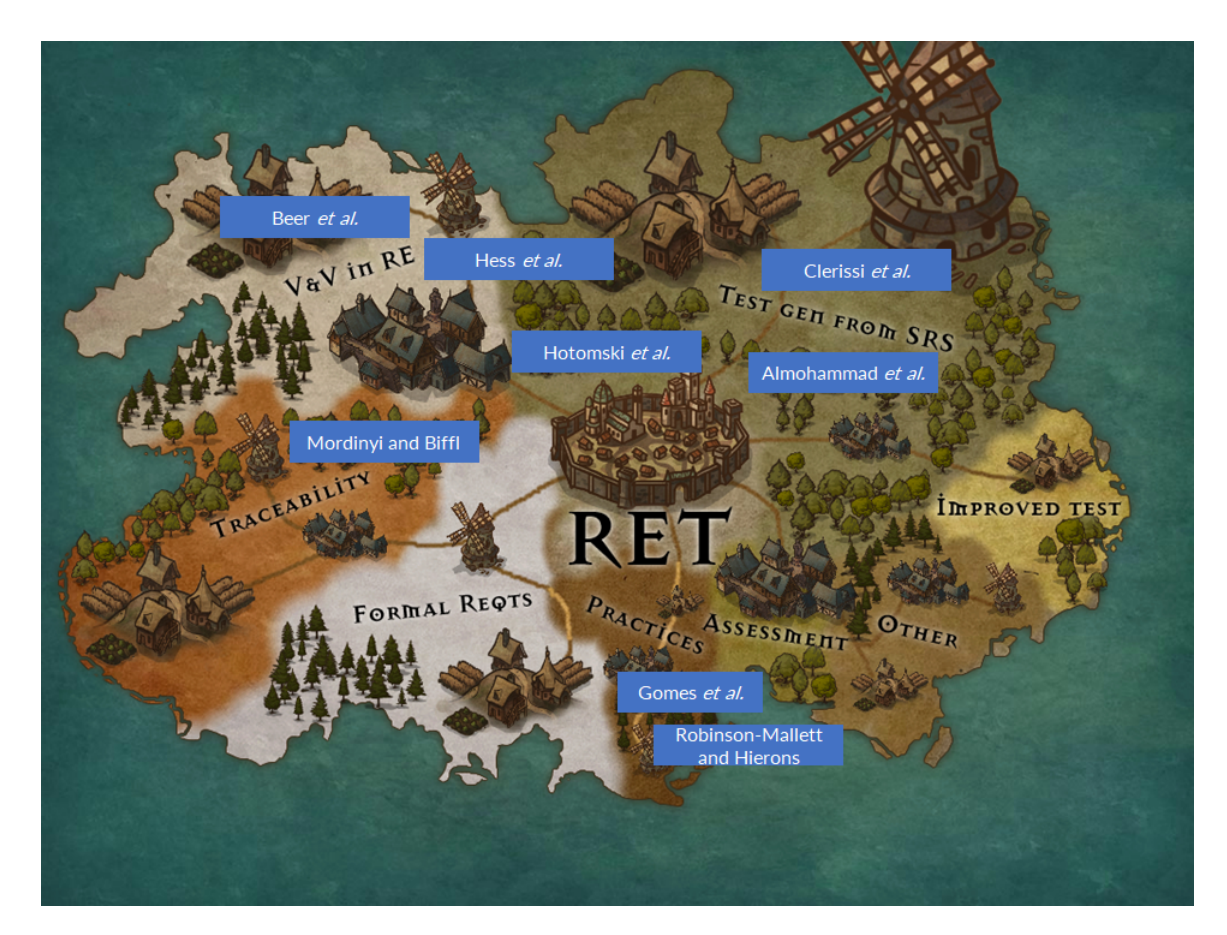
Fig. 1. A visual map of research on RET alignment.