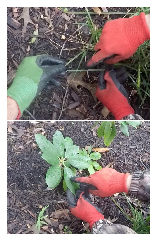
Figure 4: P9 showing the first author the difference between leaf venation of a monocot (above) and dicot (below).

with her hands, she explained: "You have this vein here, but then you have these little veins coming off the sides ... so they're not parallel." This information would have been difficult to communicate without a shared field of view, gestures, and haptic feedback from the veins: all elements that can be seen as inherent to face-to-face interaction.