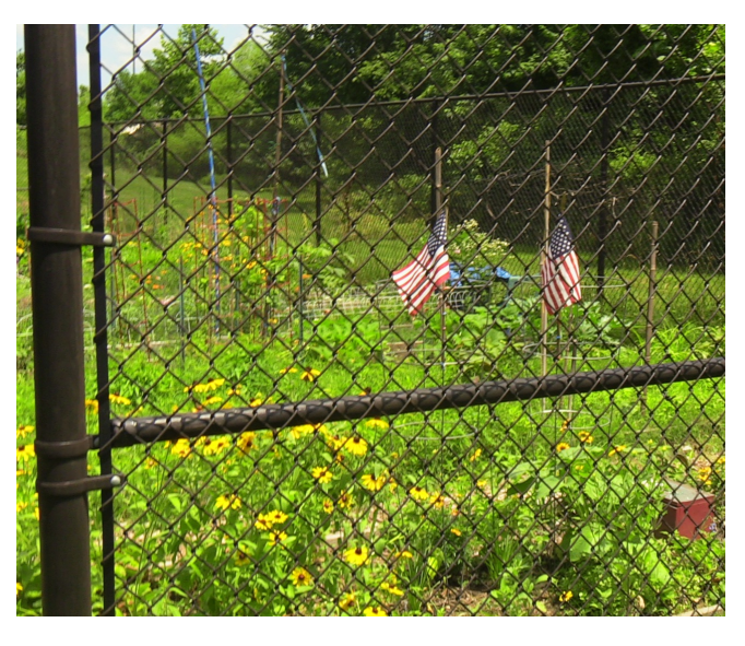
Figure 3: P1 decorated the garden for a national holiday with flags, visible through the chain link fence, to show community sentiment.

A form of interaction that we discuss in this paper is skill sharing in the garden, a recurring theme in our interviews and observations. More experienced gardeners in our study often