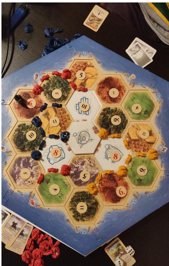
Figure 1: Hybrid Settlers. Settlers of Catan with four dynamic tiles.

Walther Jensen Aalborg University Aalborg, Denmark bwsj@create.aau.dk