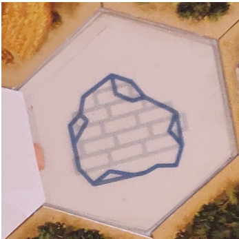
Figure 3: Fabricated dynamic tile with brick and ore resource. Ore is visible and thereby active.