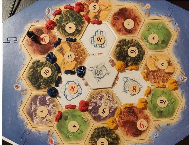
Figure 5: Game board during play through of Hybrid Settlers in the study.

to the standard ten points. In the first study we asked the participants to first play a game of regular Settlers of Catan followed by a game of Hybrid Settlers in which the tiles would change randomly as described above. In the second study we again asked participants to play two games, for the first play through the participants could change the resource of the dynamic tiles using the Bluetooth controller if they rolled the number placed on the tiles and for the second play through it required rolling a pair. We conducted a semi structured interview session when the second play through was finished to receive feedback on their impressions of the differences between the two play through.