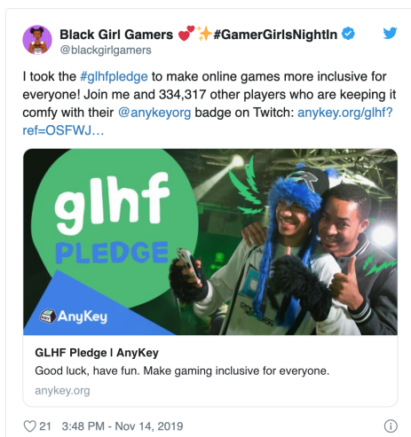
Figure 4. Pre-composed tweet shared by GLHF pledger.

December 31, 2019. During that time more than 400,000 people visited the campaign website. 126,441 of those individuals took the pledge, bringing the total number of signers to 374,049 by the end of the year. To date, 92% of all pledgers unlocked their AnyKey global chat badge on Twitch (refer back to Table 1 for comparison details).