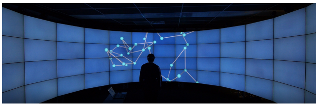
Figure 3: A Type 4 graph in CAVE2.

As seen in Figure 3, a type 4 graph (along with types 2 and 3) require the participant to use either the wand to navigate or use the HoloLens to view the rest of the graph to continue the search.