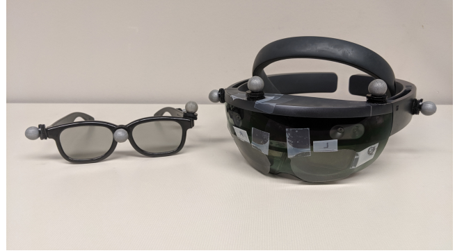
Figure 1: Standard CAVE2 glasses (L) and retrofitted HoloLens (R) with optical tracking markers and passive stereo lenses

The HoloLens was retrofitted with retro-reflective markers as shown in Figure 1 and tracked using the CAVE2's optical tracking system. This was done to more accurately align the HoloLens optics with the CAVE2 displays by using the same system as normally used with the tracked passive stereo glasses. The HoloLens was also fitted with the same lenses as CAVE2's stereo glasses. In order to avoid the HoloLens internal optics interfering with the polarizing