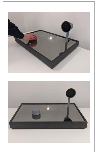
Figure 1: Images of Radio-Tuner-Thing working prototype.

everyday items which we barely notice in our preoccupation with getting on with daily tasks. So, for example, when drinking a glass of water, we pay little attention to the glass or, for that matter, the water itself. By contrast, things are objects which we come to notice because they interrupt these usual, unregistered interactions. This might happen where, for example, the glass breaks or we note that the glass has a particular significance (eg.because it was inherited). Ironically, as we come to pay more attention to an object as a thing, it becomes both more knowable and more inscrutable. We see it properly but, in so doing, we become aware of the inexhaustible wealth of meanings it may represent.