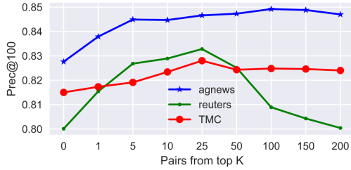
Figure 3: 64 bit PairRec while varying the top K.

Performance gain by pairwise reconstruction. We compute the Prec@100 with and without the pairwise reconstruction and plot the scores in Figure 2. The largest improvements occur for 64-128 bit on the reuters dataset, but across all datasets and bit sizes, pairwise reconstruction obtains consistent improvements. In comparison, the original RBSH paper [7] also did an ablation with and without weak supervision, but found their improvements to be primarily isolated to 8-16 bits. This further highlights the benefit of using a single weakly supervised document, rather than combining multiple sources for generating ranking triplets as done in RBSH.