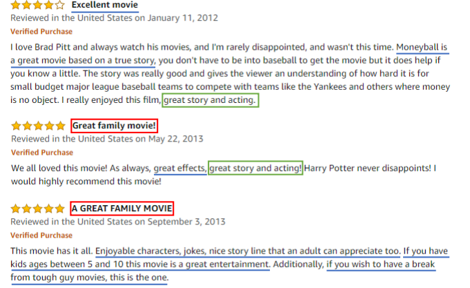
Figure 2: Three user reviews for different movies from Amazon (Movies & TV category). Sentences of explanation purposes are highlighted in colors. Co-occurring explanations across different reviews are highlighted in rectangles.

Then, a follow-up problem is how to detect the nearly identical sentences across the reviews in a dataset. Data clustering is infeasible to this case, because its number of centroids is pre-defined and fixed. Computing the similarity between any two sentences in a dataset is practical but less efficient, since it has a quadratic time complexity. To make this process more efficient, we develop a method that can categorize sentences into different groups, based on Locality Sensitive Hashing (LSH) [14] which is devised for near-duplicates detection. Furthermore, because some sentences are less suitable for explanation purpose (see the first review’s first sentence in Fig. 2), we only keep those sentences that contain both noun(s) and adjective(s), but not personal pronouns, e.g., “ I ”. In this way, we can obtain high-quality explanations that talk about item features with certain opinions but do not go through personal experiences. After the whole process, the explanation sentences remain personalized, since they resemble the case of traditional recommendation, where users of similar preferences write nearly identical review sentences, while similar items can be explained by the same explanations (see sentences in rectangles in Fig. 2).