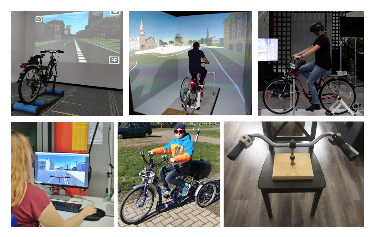
Fig. 2. Examples of evaluation methods showing different simulator setups in the lab, a tricycle on the outdoor test-track, and a prototype mounted on handlebars as discussed in [9-12, 22, 24, 25].

Cycling@CHI: Towards a Research Agenda for HCI in the Bike Lane