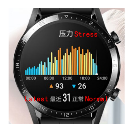
Figure 1: The stress interface on Watch GT

CHI '21, May 8-13, 2021, Yokohama, Japan