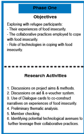
Fig. 2. Detailing Phase One study objectives and activities

3.2.1 Phase One. Herein, we adopted dialogical methods that accounted for the research context, research sensitivity and literacy levels of participants. The varying literacies of participants entailed the need to provide participants with methods that rely on imagery versus written methods of data collection. The adoption of dialogical methods enabled the participation of participants of varying literacies, the creation of a safe space for both participants and the researcher and allowed for the construction of shared narratives. Furthermore, methods were selected based on discussions between the lead researcher and refugee participants (see phase one, activity one). For a detailed account of the methodological motivations and the value of adopting dialogical methods please refer to Talhouk et al. [62] where we have presented how the methods were developed and grounded in the researchers' and participants' contexts and research objectives.