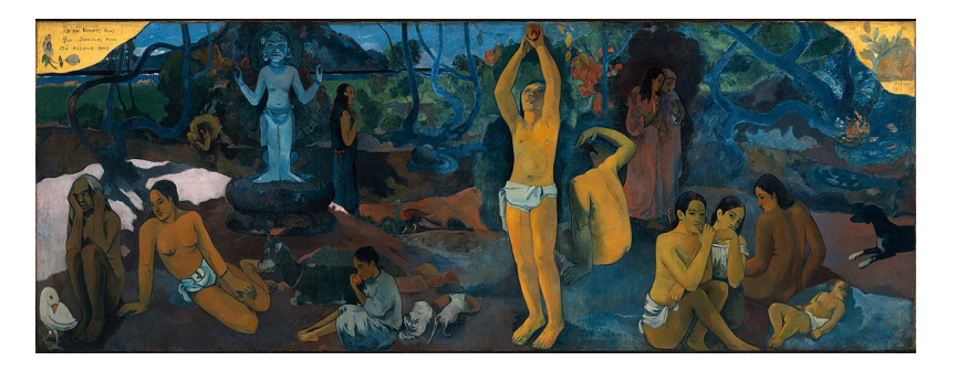
Figure 1: D'où Venons Nous / Que Sommes Nous / Où Allons Nous (Where do we come from? What are we? Where are we going?) by Paul Gauguin. Museum of Fine Arts, Boston.

Paweł W. Woźniak Utrecht University Utrecht, the Netherlands p.w.wozniak@uu.nl