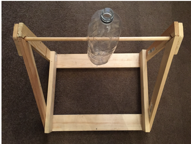
Figure 1. Spin the Bottle game apparatus

a Likert Scale from 1 – really does not describe my dog, to 6 – really describes my dog. The overall scores for each personality trait (extraversion, motivation, training and focus, amicability and neuroticism) are obtained by summing up the scores assigned to all the adjectives associated with a particular trait and calculating the percentage against the maximum score available. This is done to ensure scoring consistency, as not all traits are associated with the same number of adjectives and therefore not all traits have the same maximum score. In our study, the order in which the adjectives were presented was randomized to reduce the chance of proximity errors [25]. The questionnaires were printed out and, for each participating dog, the caregiver most familiar with them was asked to complete the questionnaire. The personality questionnaire was completed before any specific details about the game were divulged, to ensure that the caregivers' answers to the questionnaire were not biased either by their anticipation of how their dogs might perform or by their dogs' performance during the experiment. After completion, the paper copies were given a unique number and labelled with the dog's name and owner surname ready for analysis.