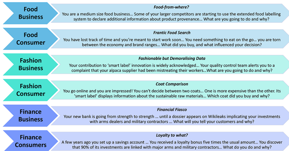
Fig. 3. Summary of business and consumer dilemmas used.

processes that make information about our daily engagement with society visible to others. This was also a message we imposed on transparency practices within this fictitious focus group to push participants' boundaries of tolerable practices. The use of exposition and imposition in our LARP also served to stretch participants' imaginations about the positive and negative consequences of information visibility, which were revealed in the story of their characters' lives in this new age of total visibility.