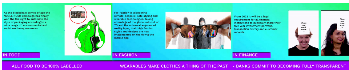
Fig. 4. Future scenarios summarised in news reports of the year 2030.

When participants joined our online workshop, we introduced them to the game and performed a ritual to signify their entry to the Live Action Role Play (LARP). Our LARP took the form of a focus group, run by a fictional research company called True Insights, to study shifting attitudes and practices around transparency in a highly information-dependent society. The ritual to enter the LARP involved the ringing of a gong, prompting participants to change their screen name to the name of the character assigned to them. Once in the LARP, participants were greeted and briefed on the research activities by two game coordinators, playing the roles of True Insights employees.