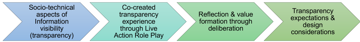
Fig. 1. Research design: Problem area, methodology, and findings.