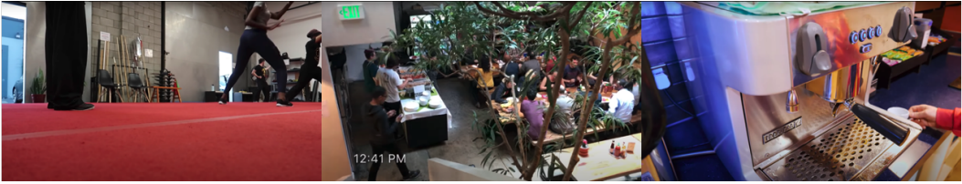
Fig. 2. Vlogs also give us a glimpse of what developers do outside work e.g., practicing Taekwondo (left), how they spend their social hours e.g., developer grabbing lunch with friends (center), or their me-time at work e.g., developer brewing a cappuccino for themselves (right). The vlogs give us an idea about the developer's lifestyles and the hobbies they enjoy.

can discourage the emerging generation of software developers who are interested in pursuing what can actually be a collaborative and social career [56]. Although these negative perceptions exist, developers have been doing the work to strategically dismantle these stereotypes through the use of hashtag movements [36], written blog posts [11], and podcasts [71]. However, there has been limited research on understanding how creators and consumers of vlogs can combat these misconceptions by showcasing experiences where the technical workers can control their own story of their profession.