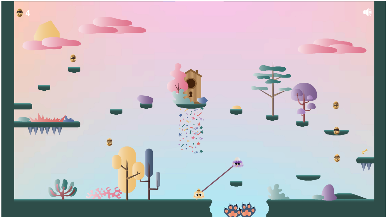
Figure 2: A screenshot of the fourth level of Eggventures. It shows all elements of the game: static and moving platforms, pits and spikes, a key and eggs to collect, and the birdhouse that marks the exit. Players control the two birds and have to jump and catapult each other via a connecting rubber band to traverse the level.