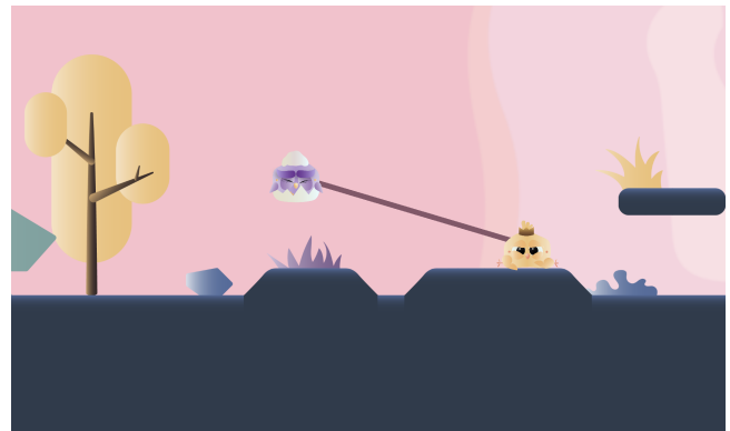
Figure 1: In one version of our Eggventures game, a rubber band ties together the two player characters. Players have to make use of it to catapult each other through the levels.

how input mechanics influence connectedness through a study of a cooperative platforming game. In our Eggventures game (shown in Figure 1), pairs of players could either independently traverse the levels or were tied together with a rubber band and then needed to make use of a catapulting mechanic during play. We compare the two variants in a between-subjects study and find that the rubber band mechanic was more challenging for the players, but in turn increased how much they communicated and consequently also their feeling of connectedness.