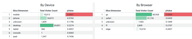
Figure 2: Example of a Looker root cause analysis report.

One of the first experiments to trigger the new alerts was making changes which unexpectedly affected page performance, especially on mobile devices. The resulting increase in data loss rate resulted in an SRM. Because mobile devices were one of the segments offered in the root cause analysis dashboard, the root cause was quickly identified, saving precious analyst and developer time.