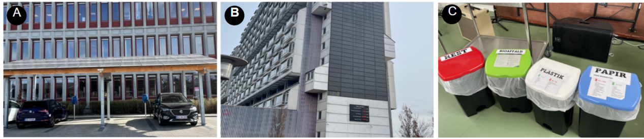
Figure 1: Energy Community Avedøre: A) The high school’s electric vehicle charging station. B) The apartment complex “Store Hus” with a display showing power generated by solar photovoltaic panels. C) Waste sorting in a company involved in Energy Community Avedøre.

demonstration efforts. Thus, EFA is still in its infancy regarding efforts to manage the production and distribution of energy. The role of the authors in this project is to provide insights on human engagement in EFA, and how the digital platforms in EFA may be designed from a human-centered perspective.