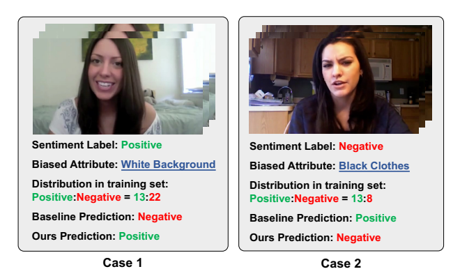
Figure 3: Two testing cases of the baseline (i.e., Self-MM) and GEAR on the neg./pos. results.

To gain more insights into our model, we randomly selected four cases to explain how the spurious correlations in video modality affect the traditional MSA model and why GEAR is able to handle such spurious correlations in the testing set. We illustrated the binary (neg./pos.) results of Self-MM and GEAR on four testing samples from MOSI datasets in Figure 3 because the Self-MM shows the best overall performance (i.e., AVG (OOD)). To learn the debiasing ability of our model, for each case, we recognized its biased attribute and counted the sentiment frequency of this biased attribute in the training dataset. There are 93 videos in the MOSI dataset, each of which has several clips. The clips in the same