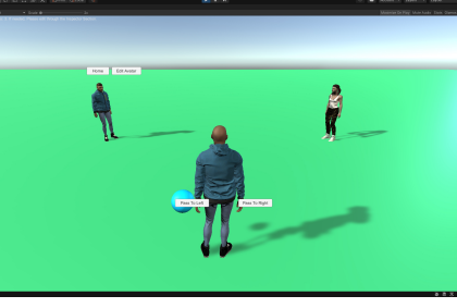
Figure 4: Scene 4: Exclusive Game (This shows the 3rd person POV version)