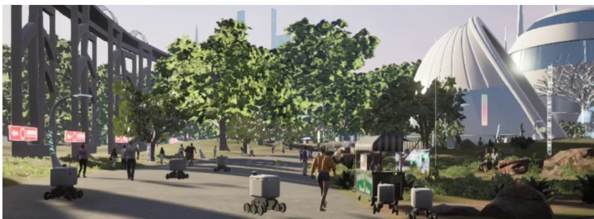
Figure 1: A view of the futuristic environment presented in the online study to the participants. In this city, we show the co-existence of human and AI agents and their prosocial interactions.