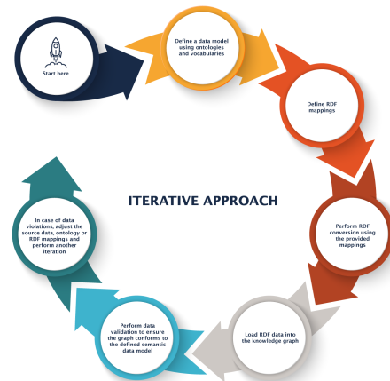
Figure 1: Iterative KG Creation Approach

When violations are observed during data validation, the results can be used as a starting point to improve the pipeline. For example, source data can be fixed by performing data cleansing, adjusting the ontology or RDF mappings, or performing another iteration of the data integration process or ETL pipeline.