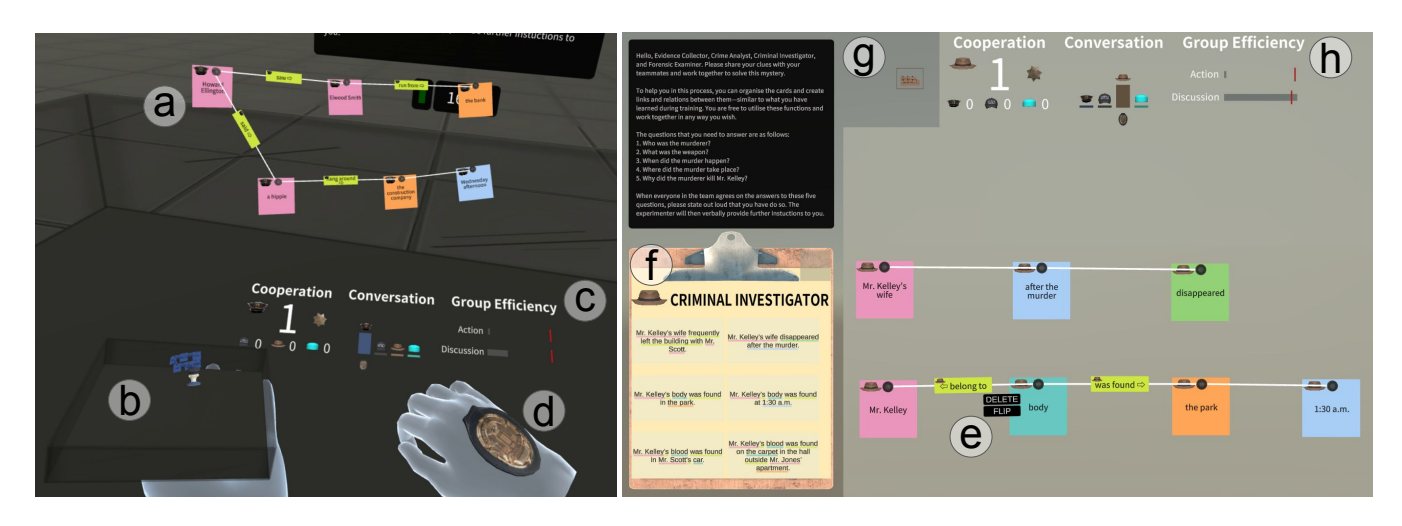
Figure 1: The final VR system (left) and desktop interface (right) that we developed after four iterations. (a) Notes with pins, and links with labels attached to the notes. (b) A 3D minimap is shown above the left palm in VR (the clipboard on the inner side of the palm is hidden to save room), with avatar, notes and links coloured the same as the role colour. (c) The gamification board in VR is attached to the body at waist height. (d) The embodied badge is on the back of the hand. (e) Buttons are shown for a note while selected. (f) Clipboard on the desktop interface. (g) Minimap on the desktop interface, with a coloured square showing the current field of view. (h) Gamification board on the desktop interface.

Mark Billinghurst University of South Australia Adelaide, South Australia, Australia mark.billinghurst@unisa.edu.au