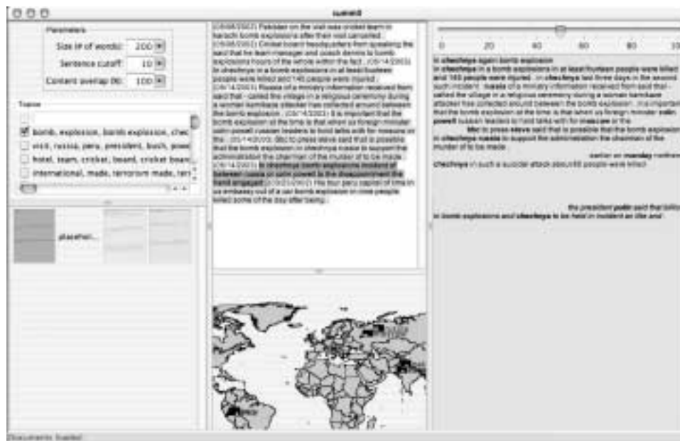
Fig. 3. The iNeATS interface.

MMR [Goldstein et al. 1999] algorithm. A sentence is added to the summary if and only if its content has less than X percent stemmed word overlap with the summary. NeATS uses the Porter stemmer to stem the tokens and X is a parameter of the summarization process that can assume values between 0 and 100. Once every sentence has been scored, an automatically trained function combines the scores into a single value for each sentence.