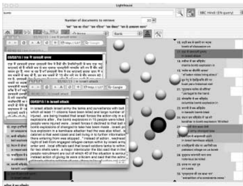
Fig. 1. The Lighthouse interface with open document windows.

done because no Java-based Hindi stemmer was available to us during the Surprise Language Exercise, and there was no time to implement one ourselves.