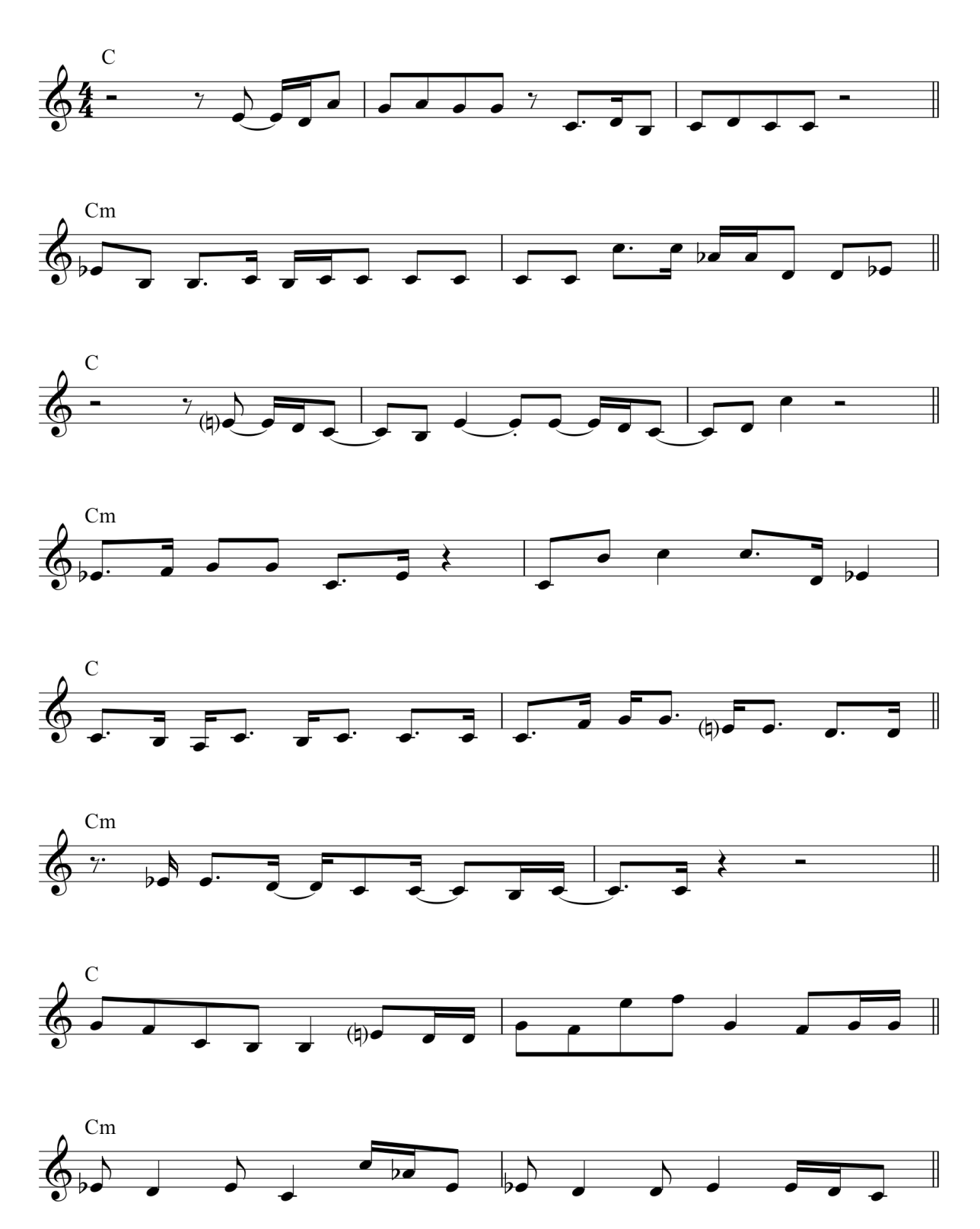
Figure 4: Eight generated ostinati (four examples each for C major and C minor).