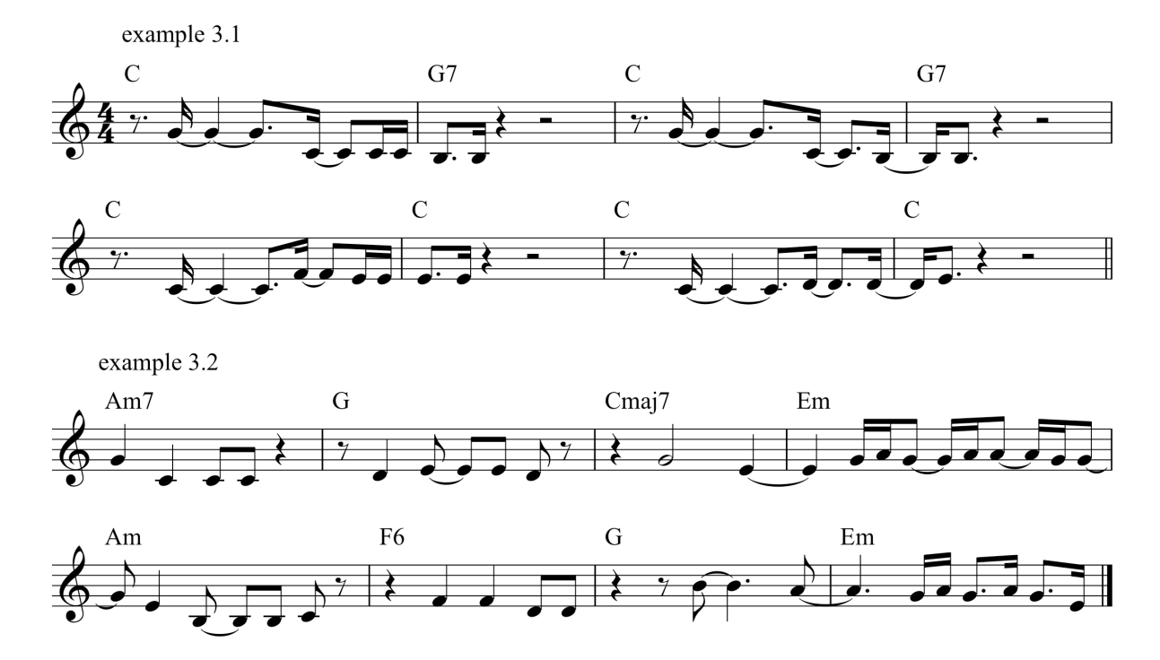
Figure 3: Two example generated lead sheets of eight bars

Figure 3 presents two example leadsheets, each restricted to eight measures only, to give a flavor of the generation. The parameters are the defaults for the leadsheet generation algorithm as per the last column in the table. No attempt has been made to cherry pick, these being the first two created directly for this example.