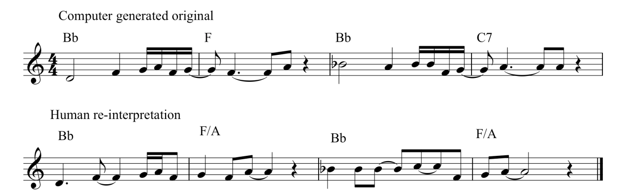
Figure 6: Computer generated original chorus material versus eventual human finished song

actually of strong potential in showing future revision possibilities for the generating algorithm.