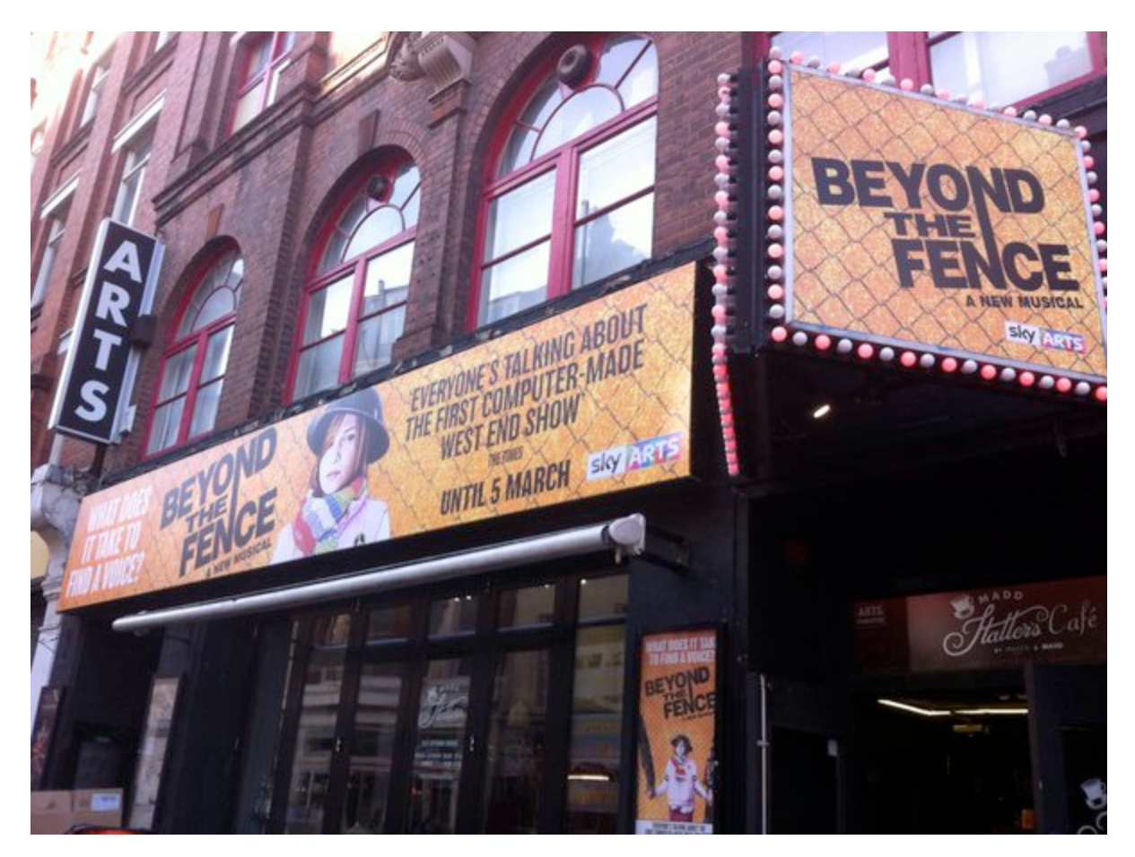
Figure 7: The musical at the Arts Theatre, London

music concert of cognoscenti. Though, as detailed in the previous section, the material had gone through human modification to varying degrees without the involvement of the original researchers, there was a computational presence within the final musical theatre piece. On 26th February 2016, a real West End theatre show was judged by real theatre critics from national media, and the show had a two week run around this gala performance (Figure 7).