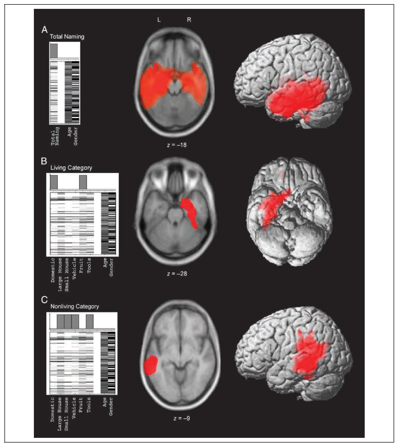
Figure 1. Brain areas that positively correlate with: (A) total naming score; (B) living scores; (C) nonliving scores. Design matrices and contrasts are displayed for each analysis. The threshold for display is p < .001, uncorrected. Maps of significant correlation are superimposed on axial sections of the unsmoothed template image and on the 3-D rendering of the MNI standard brain. The coordinates of the sections correspond to the peak of each significant effect (see Table 3).