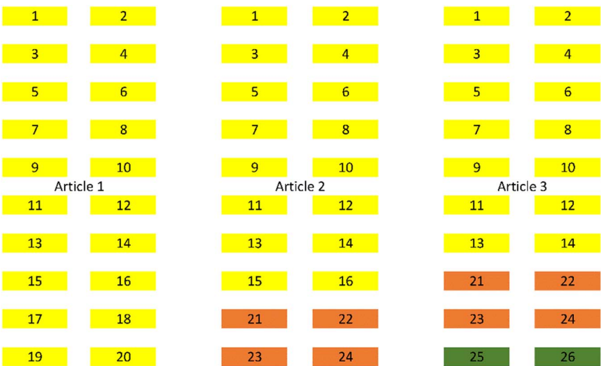
Figure 1. Three articles with partially overlapping authors clustered into one group. Colours indicate authorship overlaps. Although articles 1 and 3 have fewer than 80% authors in common, they both have 80% in common with article 2 and so are grouped into a single cluster.

score for each paper by the world average of all papers published in the same field and year. This avoids advantages for older articles (because they are normalised against contemporary articles) and for high citation fields (because they are normalised against articles from the same field). The log transformation \ln(1 + c) was applied to all citation counts before any calculation to reduce the impact of individual highly cited articles so that (a) the data is less skewed and it is more reasonable to average it with the arithmetic mean and (b) the resulting figure is less subject to variability (Thelwall & Fairclough, 2017). Most articles were in multiple fields and in these cases the arithmetic mean of the values for each field was used.