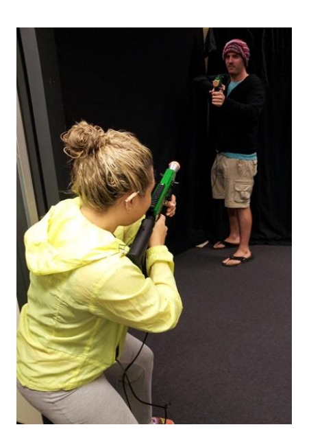
Figure 3. Example of a participant clearing an area.

Participants each completed one practice circuit beforehand. This was used to familiarize them with the task but not used to screen out any participants. Participants completed all three conditions in a within subjects design. For each condition, participants completed 4 full circuits of the floor without stopping. There was a break of approximately 2 min between each condition. During this interval participants had time to recuperate in case they were physically tired from their efforts in the previous condition. During this break the research assistants were free to swap zones with other research assistants. Participants completed the workload and task focus scale items immediately after completing each experimental condition, for a total of 3 times. The order in which participants completed the conditions was counter-balanced. No feedback on their performance was given until the end of the experiment. The experiment took approximately 20 min to complete.