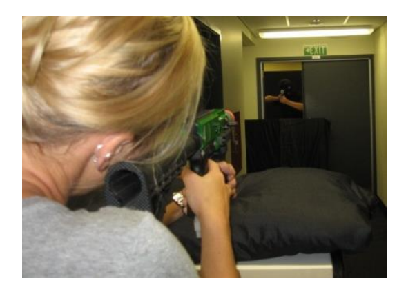
Figure 6. Example of the firearm task setup.