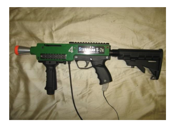
Figure 4. Modified Steradian SX-7 infrared emitter gun containing added micro switch (see below the grip).

Questionnaire. A paper-and-pencil version of the NASA-TLX (Hart & Staveland, 1988) was used to subjectively assess workload. This was the same as the version used in experiment one. It contained four of the NASA-TLX subscales: mental demand, physical demand, temporal demand and effort. A global workload measure, which was simply the average of the four subscales, was also of interest.