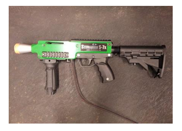
Figure 1. Steradian SX-7 infrared emitter gun.

A modified version of the NASA-Task Load Index (TLX) scale (Hart & Staveland, 1988) was used to gauge subjective workload. This version was determined via prior factor analyses (see Bailey & Thompson, 2001; Ramiro, Valdehita, Lourdes, & Moreno, 2010) and consisted of the following four subscales: mental demand, physical demand, temporal demand, and effort. A global workload measure, which was the combined average of the responses to the four subscales, was also of interest. In addition, to measure their "task focus," participants answered three self-report questions: one about concentration (How focused on the task were you?), one about task-related thoughts (How much did you think about the task?) and one about task-unrelated thoughts (How much did you think about something other than the task?). The average of these was calculated to give the "task focus" score. Both the NASA-TLX and the Task Focus questions were rated on a 0-100 scale and completed with paper and pencil.