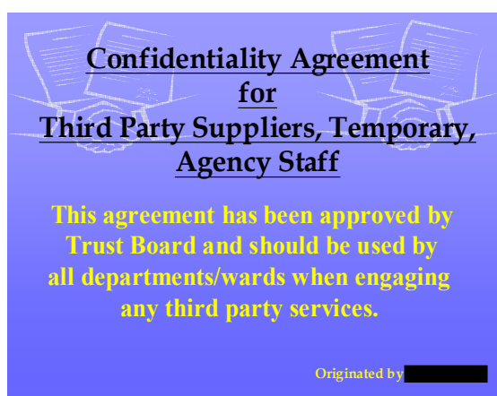
Figure 1. Privacy screen saver.

A selection of screen savers were then selected and put on the system. However, after a period of time user complaints still arose about these screens, e.g. “what do I want to look at somebody’s holiday snap for and what do I want to look at this and that for?”. It was then decided by the screen saver development team that the resource would become an information board. There was a marked decline in complaints after this point and a dramatic increase in user involvement. Initially the application cycled through IT security advice screens (see fig 1) e.g. securing personal data, incident reporting etc.