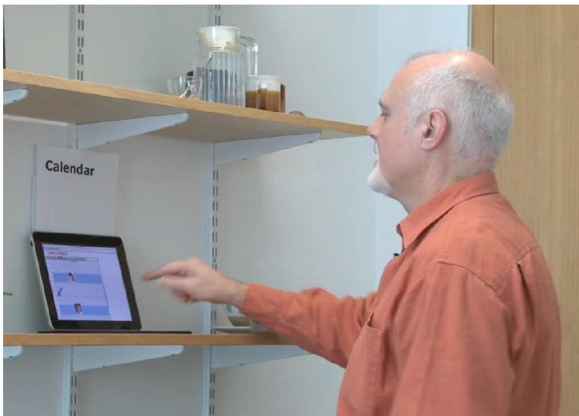
Figure 1: Screenshot of the video: The older user, played by an actor, is talking to the ICA while looking for information on the calendar, shown on the iPad.