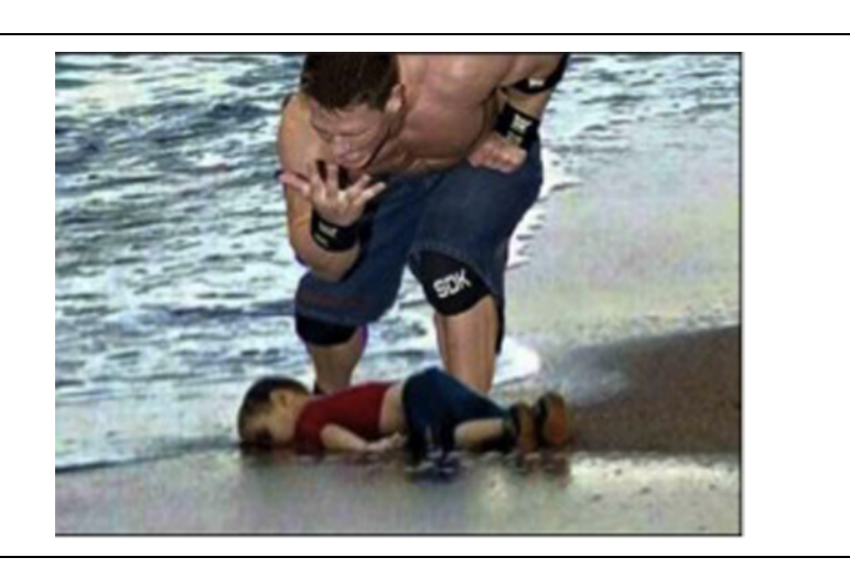
Figure 4. Available at: http://imgur.com/3UWguQf.