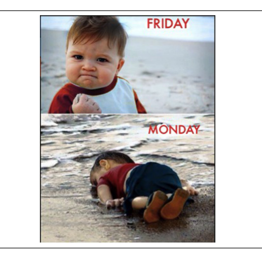
Figure 2. Available at: http://imgur.com/HuHCIkC.