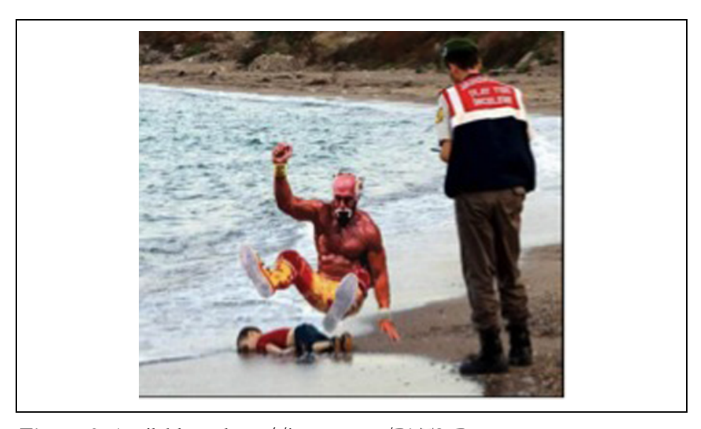
Figure 3. Available at: http://imgur.com/BjtTSvB.