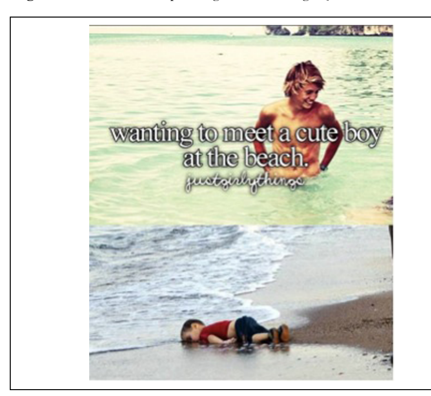
Figure 5. Available at: http://i.imgur.com/bts3rPY.png.

On one hand, this exchange shows that the racist nationalism on the subreddit was not universal, and perhaps that some users were unaware that the humor cloaked other agendas. On the other hand, it is also an