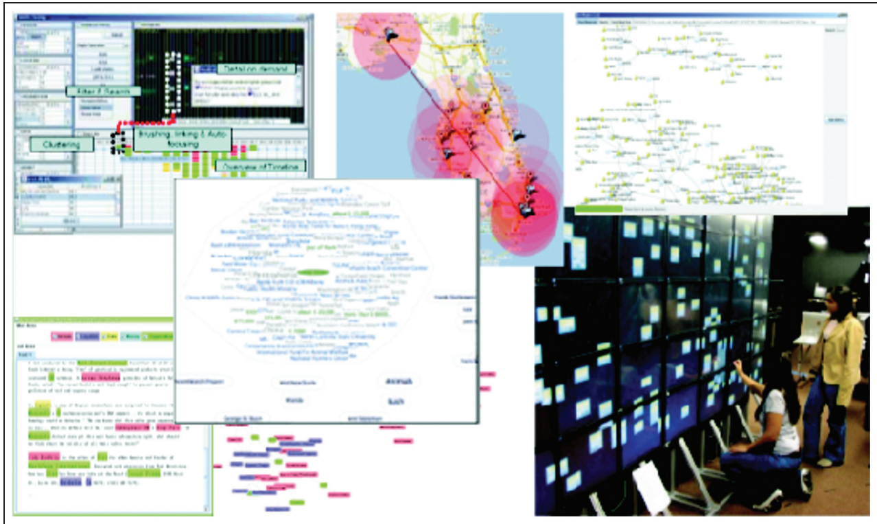
Figure 4. Examples of tools produced by graduates in the Information Visualization course.

include variations of network visualization, tag clouds, timelines, geographic overlays, notes organizers, text highlighting, facet browsing, and complex query interfaces. The teams typically are able to discover 50%–100% of the ground-truth plot using their tools. An open question is whether we could arrange the project such that all the teams work together to produce an integrated tool. This could expose the students to a larger engineering project but would reduce each team's autonomy in pursuing their own interests.