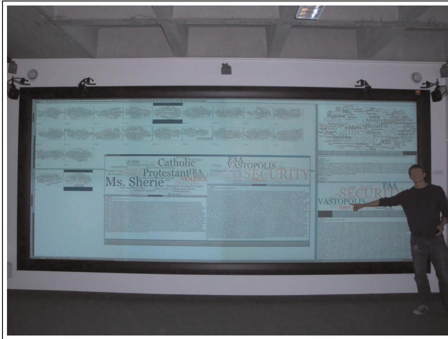
Figure 2. Comparative analysis of text clouds in Mini Challenge 3, 2011, at the Konstanz Powerwall display.

toward downtown. More information about the approach is provided in the study by Bertini et al. 38