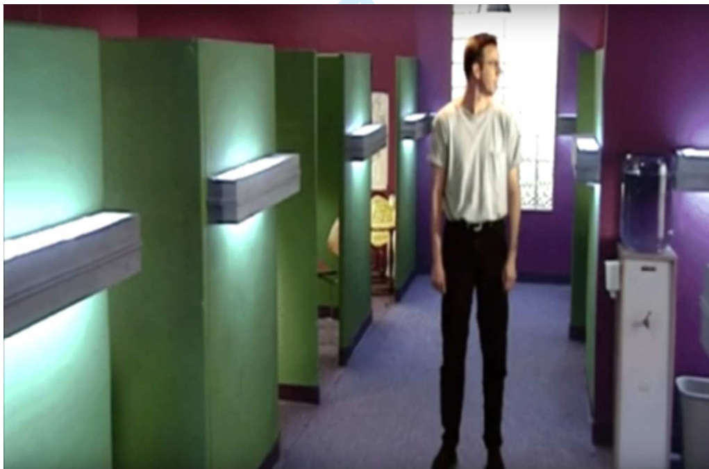
Figure 2. Phantasmagoria 2: A Puzzle of Flesh gameplay scene.