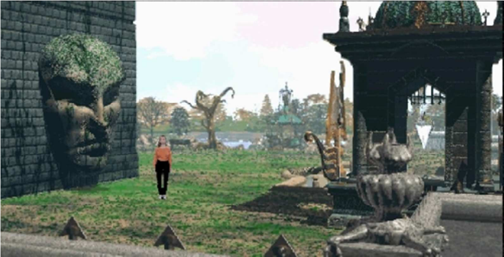
Figure 3. Phantasmagoria gameplay scene.