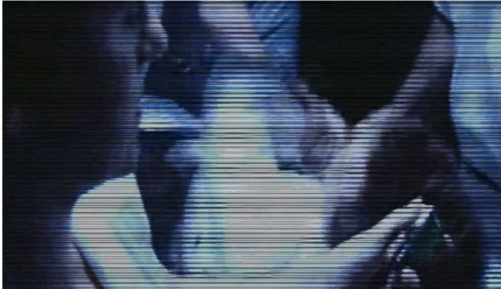
Figure 1. Phantasmagoria 2: A Puzzle of Flesh opening scene.