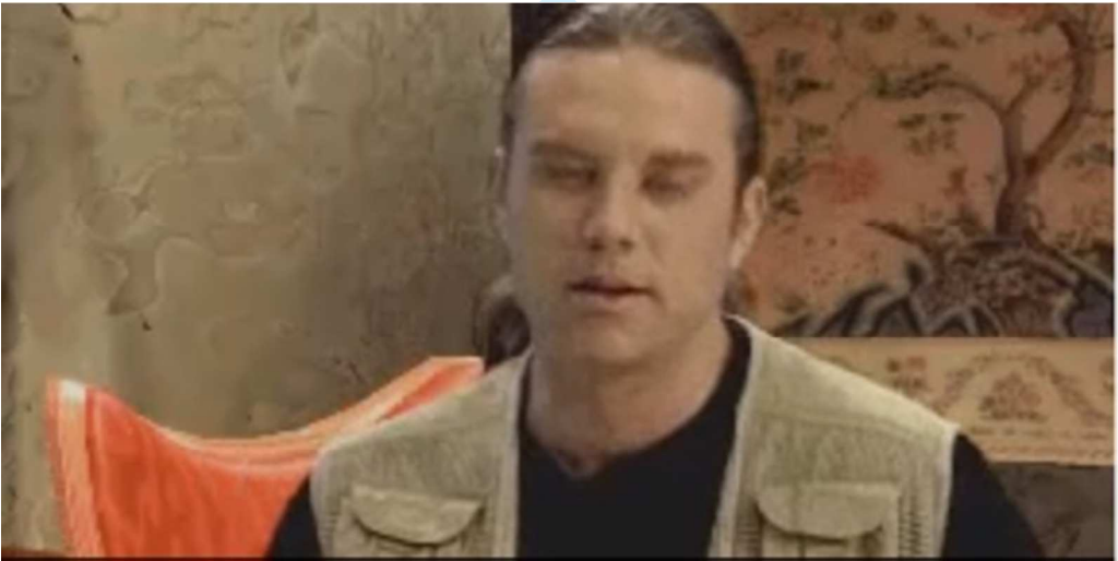
Figure 4. Phantasmagoria opening scene.