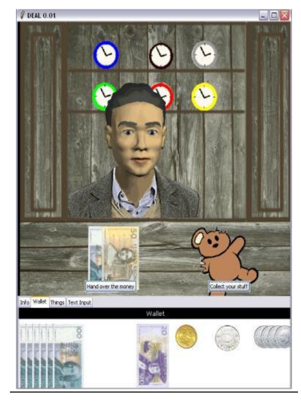
Fig. 6. A dialogue example with DEAL (from [21])