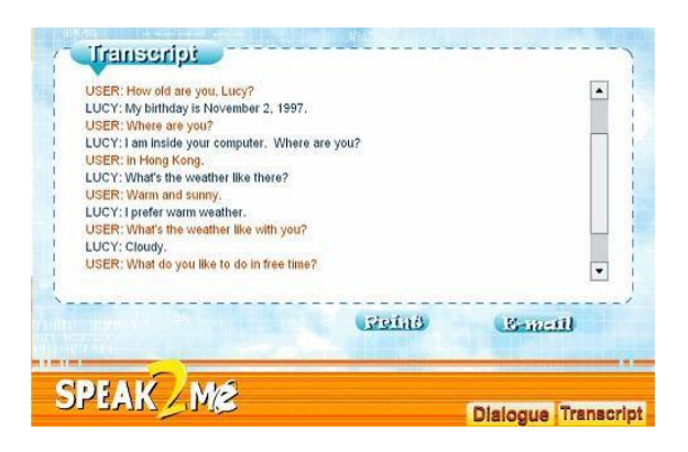
Fig. 4. A sample of chatting with Lucy

In this context Speak2Me.net website is built to help Chinese learners to learn English language. The website includes Lucy chatbot that represent a young British lady where learners can chat with her. Figure 4 shows a sample of chatting with Lucy. Jenny is another chatbot that is used in English2Go.com website to enable learners to practice English via chatting. On the same manner Jabberwacky² chatbot is used for language practice, where it can learn from all its previous conversations. Robin [46] suggested that learners