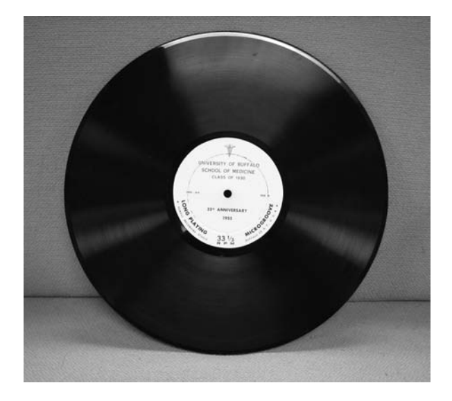
"The Philips original cast recordings of My Fair Lady was one of the first million seller LPs together with Van Cliburn playing Tchaikovsky's First Piano Concerto " (MacQuarrie et al., 2000, 1956 section).

opinion that the familiar vinyl long play will be supplanted, probably within the next decade by a paper or paper-thin plastic magnetic disc. With such a disc, use-wear, almost entirely a function of stylus friction, will be eliminated. Others who hold that the future is in magnetic tape, look for vastly improved multi-track tape and miniature tape-cartridges. Others still feel that such revolutionary processes as General Electric's thermoplastic recording (TPR), again without frictional contact, will make all other methods obsolescent. (Nolan, 1961, p. 264)