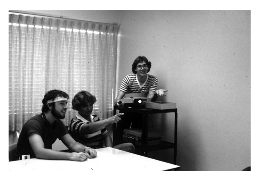
"Next slide, please." State University of New York at Buffalo health sciences students circa 1976.