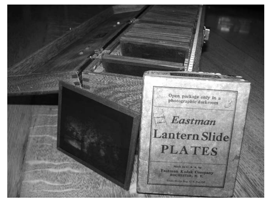
The projectionists for lantern slides were called lanternists, and the projectors had the name Magic Lantern (Witcombe, 2001).