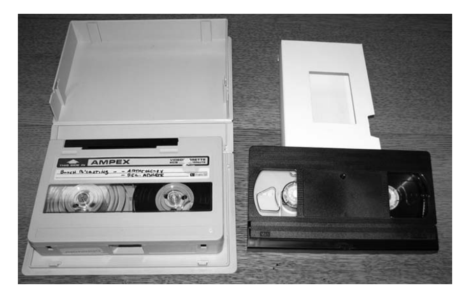
"The Library of Congress facility in Culpeper, VA, holds thousands of its titles on U-matic video, as a means of providing access copies and proof for copyright deposit of old television broadcasts and films." (Wikipedia, "U-Matic," 2009)

lecting videos for circulation. "Libraries were presented with an exciting new opportunity. Video was not only new and popular, it was a library service developed from user demand. At the same time, home use of VHS and off-air taping opened up new opportunities for classroom teachers to offer audiovisual materials without the time consuming task of booking films and waiting for delivery" (Mason-Robinson, 1996, p. xi). Large screen video projection systems soon followed, and academic media centers made the transition to yet another media format.