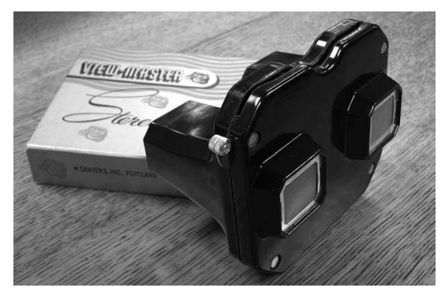
The View-Master's popularity increased when the U.S. government purchased six million discs to help train troops during World War II (Bertuca, 2009, View-Master section).

play these cartridges, it was long gone. Not even knowing the name for the medium, it took some research to determine that it was commonly called a Magi cartridge. The very short duration, less than 8-10 minutes, must have limited its usefulness. It made me wonder what all had been produced in this format and what was now lost to history. Perhaps nothing of unique value was issued solely in that format, but how would anyone ever determine that? And it certainly made the case that information is not information if it cannot be accessed. (A. B. Wagner, personal communication, May 26, 2009)