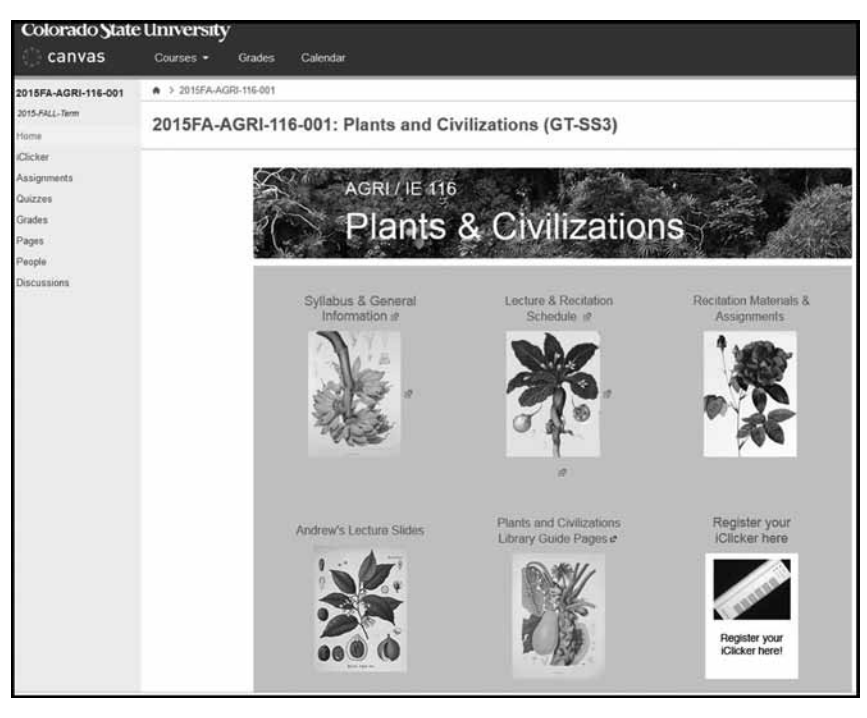
Figure 3. Screenshot of the research guide embedded in the LMS.

Figure 2. The AGRI 116 research guide, designed to assist students as they complete their term project through the research process.