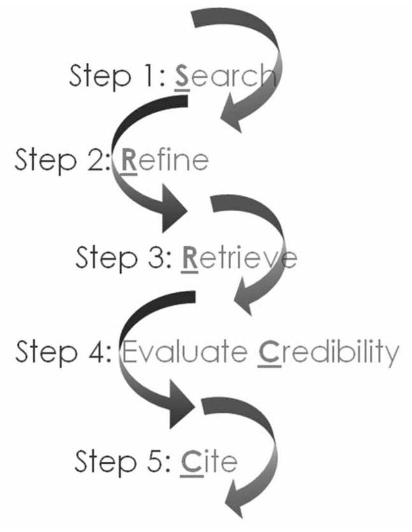
Figure 5. The five-step process used to teach students how to navigate library databases.

The librarians created an acronym, SRRCC (Search, Refine, Retrieve, Credibility, Cite), in hopes of making it easy for students to remember the process. When pronounced out loud, the initials sounds like the abbreviation circ. , alluding to the circular process of using library databases. An infographic to illustrate this process was created and included in the research guide (see fig. 5).