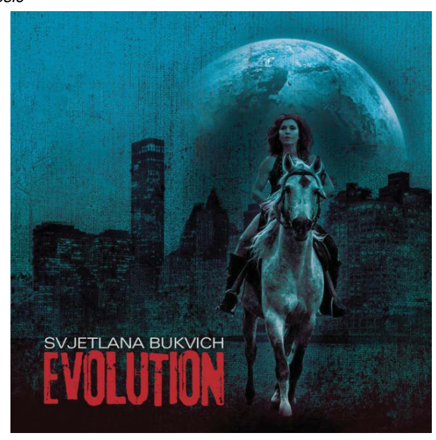
Figure 3: Svjetlana Bukvich – Evolution (CD cover).

Svjetlana Bukvich's style is unique. She works with musicians from different backgrounds and with expertise in different genres sharing intimate space of composition. By mixing genres she mixes histories. In her works we can hear a mix of progressive, eclectic, electro-acoustic, classical and jazz sound mixed with Balkan influences.