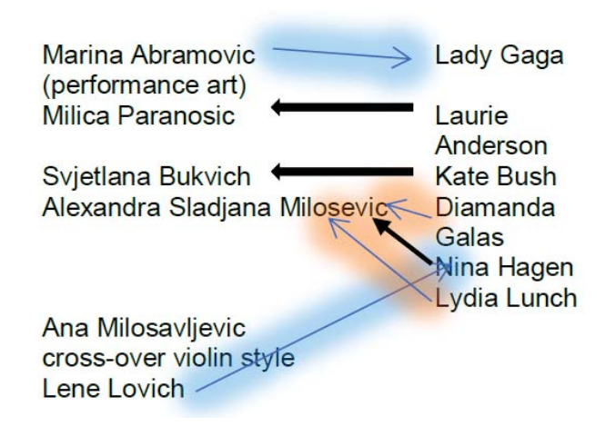
Figure 1: International influences.

Lene Lovich collaborated with Nina Hagen on a song called Don't Kill the Animals .