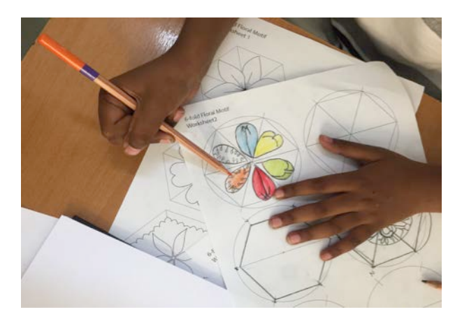
Figure 9: AYAH – Sign workshop w. Sara Choudhrey.