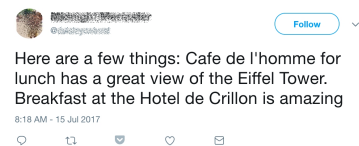
Figure 1: Tweet containing review-like data

can be exploited in other tasks, like query expansion, item recommendations, or user modelling. We define the experimental scenario in detail, and explain how we capture contextual information related to entities/events, in Section 4. We are interested in Twitter data for the unique nature of tweets. People tend to be more spontaneous and immediate on Twitter. They express relatively unfiltered opinions by giving immediate voice to their daily experience. Tweets can often take the form of a “review”, giving an insight into the tweeter’s opinion about what they are interacting with in the real world, be it a restaurant, hotel, TV show, celebrity etc. Tweets like the one in Figure 1 provide potentially valuable information about the hotels mentioned and their relationship to the Eiffel Tower, which is different from other on-line reviews (ratings/comments).