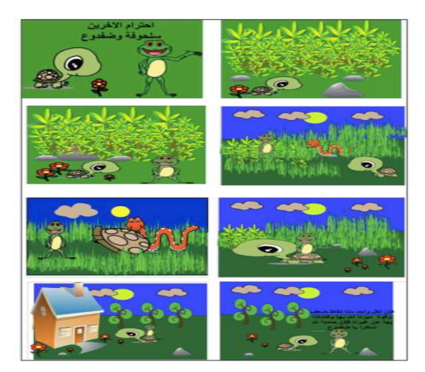
Figure 3: Producing a storyline using digital characters.

line, the used colours and shapes, and the lessons learned from the stories.