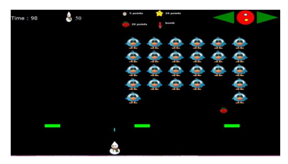
Figure1. 'Space Invaders' Game

A different style of interaction map was required for the tangible input methods as it relied on a tilting movement rather than button presses. The visualization, shown in Figure 2, not only made the actions of other players visible but also assisted users in understanding the degree of physical tilt of the controller required to generate the left/right movement inputs.