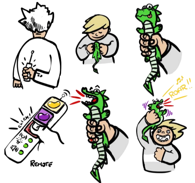
Figure 3: The therapist asks the child to reach out for a specific everyday object. As this object (a dinosaur in the example) is augmented with a remotely controlled Boost Bean, the therapist, acting as the “Wizard” can use the remote control to provide a tactile, acoustic, or visual feedback.

We identified this missed opportunity and developed an interactive means (the Boost Beans ) to augment the children’s favourite toys or other everyday objects, enabling the therapists to make them a more integral part of the vision training.