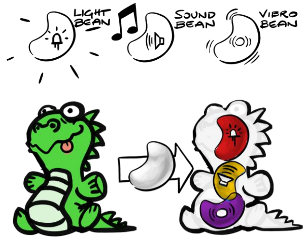
Figure 2: Boost Beans with light, sound and vibration feedback to be put into everyday objects, for example, toys.

The design of Boost Beans draws on the idea to augment everyday objects with interactive technology. It is motivated by observations we made studying the work practices of the therapists. For motivational reasons, therapists incorporated children’s favourite toys into the training sessions and these toys acted as rewards (for an example, see Figure 1). However, due to a lack of interactivity, these toys or objects were rarely part of the actual therapy sessions.