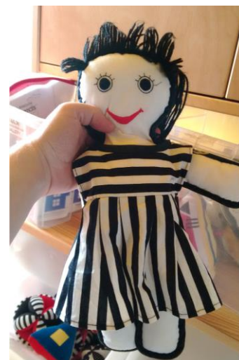
Figure 1: Toy doll as used during vision training wearing a dress with a typical high-contrast, black and white pattern, which enhances perceptibility. While this doll is a popular toy, it nonetheless does not feature any (inter)active elements, which could leverage the child's motivation to engage in vision exercises.

custom objects from scratch that feature appropriate sensory properties, for example, high-contrast with respect to the colouring. Figure 1 displays a high-contrast toy doll, which is often used during exercising, because of its horizontal and vertical stripes. The clothing of the doll is specifically designed to meet the (optical) needs of children with low vision.