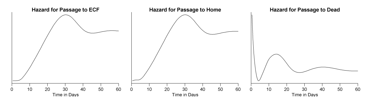
Figure 3: The conditional hazard functions for the three absorbing states if the process began in state CCU.

In Equation (22) the usual 1 in the denominator has been replaced with G_{ij}(\infty) . This makes the assumption that the process eventually ends in state j. Therefore Equation (22) gives a conditional hazard function, given the process reaches state j. Figure 3 shows the conditional hazard functions for the three absorbing states (again assuming the process began in state CCU).