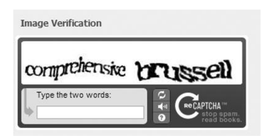
Figure 2: Combination of text and audio CAPTCHA

The second most common type of CAPTCHA is a sound based system. According to Sauer et al (2008), there are two formats for sound-based CAPTCHAs. The first would be the 'spoken words or numbers' and the second would be sounds related to an image.