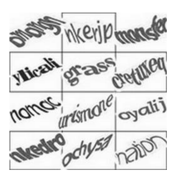
Figure 3: Example of clickable CAPTCHA (Chow, et al, 2008)

study also found it took 30 percent less time to solve clickable CAPTCHAs than regular text-based English language CAPTCHAs.